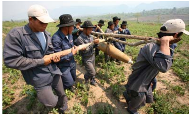
It's all about teamwork - moving a bomb prior to detonation.

Working with local communities is also a means to empower local people, allowing them to become part of the solution to their problems. Engaging local people in a positive way also helps to reduce risk from UXO in an appropriate manner and builds on the strengths of communities.