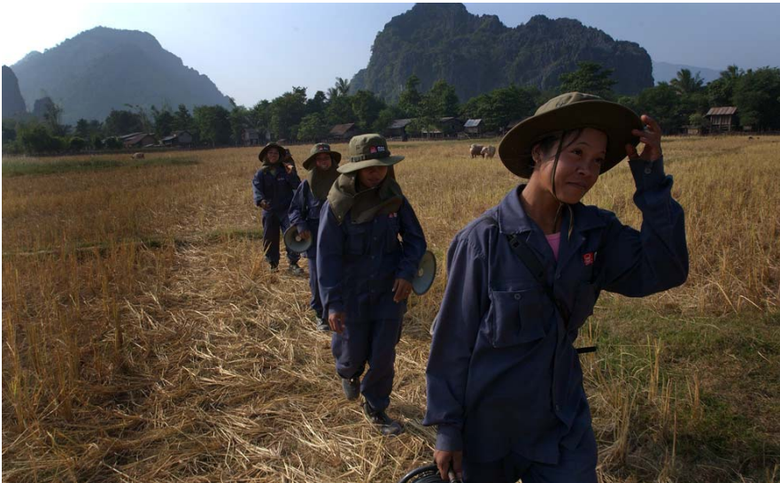
Actively recruiting women and local community members is MAG policy.

MAG is also committed to national capacity building with a clearly defined training and professional development policy, and provides technical support and advice to national UXO bodies when requested.